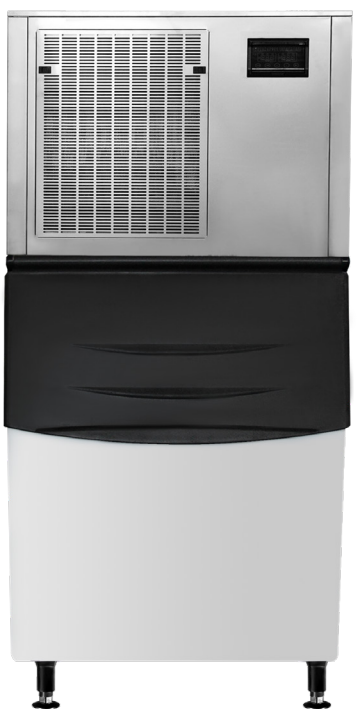
HDSIFM-2200 / HDSIFM-2650 / HDSIFM-3300