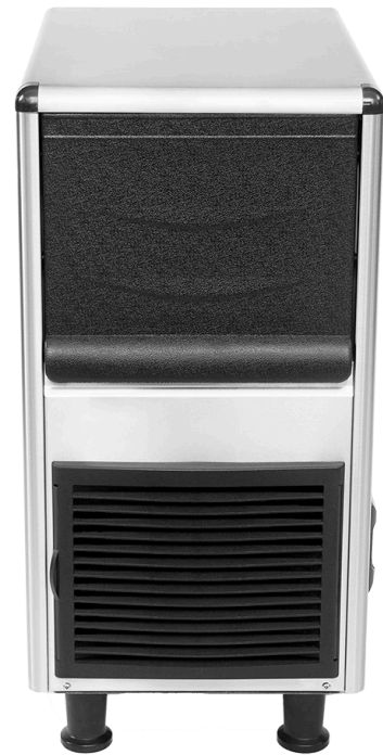
HDSIBV-55 / HDSIBV-77