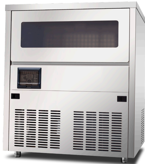
HDSIBVU-120 / HDSIBVU-165