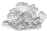
MF 56 Superflake ice Residual water content 15%