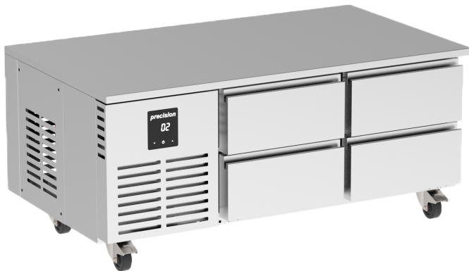
HUBC411 4 x GN1/1 Drawers

Precision Under Broiler Counters are designed to provide refrigerated storage, in an easy pull-out drawer format, under the chargrill or griddle within the cooking line. This reduces non productive time and congestion within the kitchen giving staff refrigerated storage exactly where it's needed.