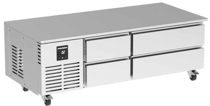
HUBC412 2 x GN1/1 Drawers & 2 x GN2/1 Drawers

Proudly made in the UK, these robust counters are capable of meeting the highest demands of commercial kitchens all around the world.