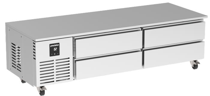
HUBC422 4 x GN2/1 Drawers